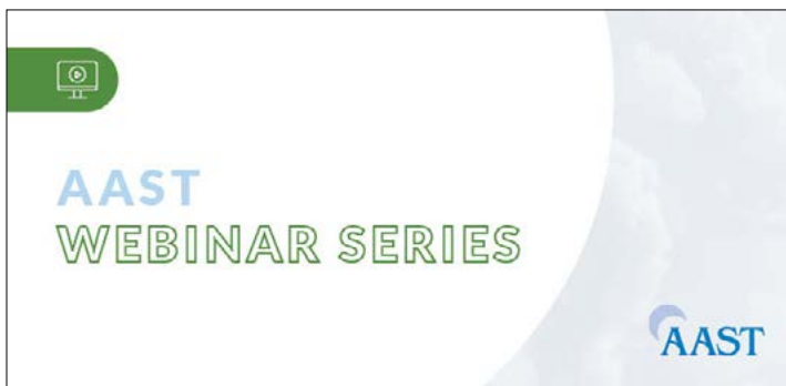
AAST Webinar Series