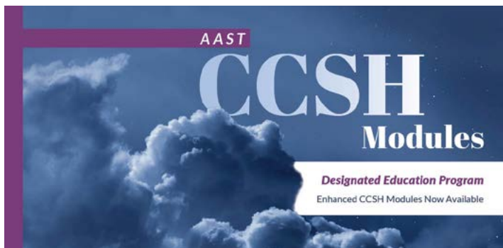
AAST Enhanced CCSH Designated Education Program Recorded Modules

We look forward to celebrating with you and the entire sleep community this October! 🌙