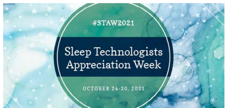
Sleep Technologists Appreciation Week 2021